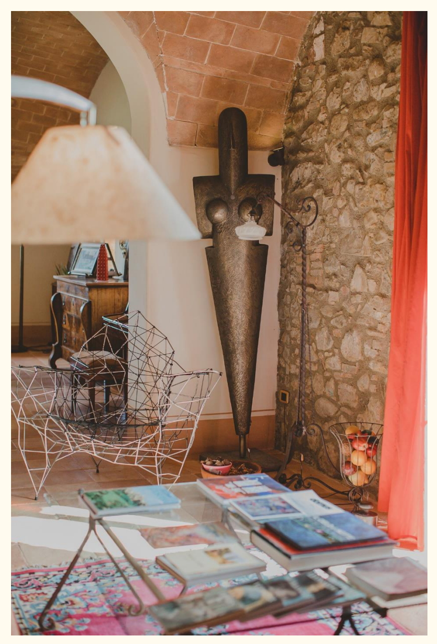
The large internal living room with exposed walls and old terracotta vaults gives a typical depiction of Tuscany. Podere Calvaiola can accommodate 50 guests (indoor seats) and 50 guests outdoor as well.