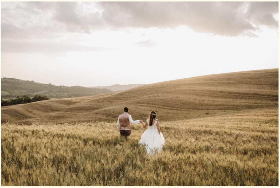
The \, large \, outdoor \, garden \, faces \, a \, scenic \, view \, of \, the \, valley.